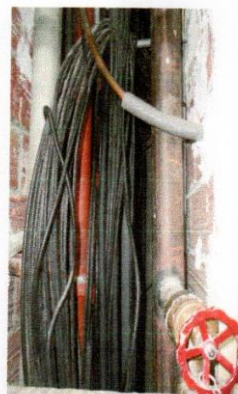
Système filaire RDC vers 15 ième (court dans caves privatives )