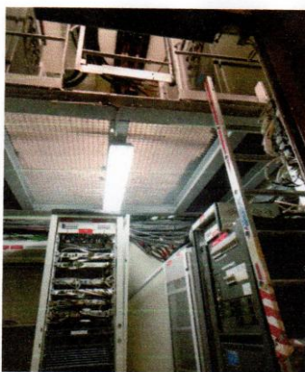
Central téléphonique Régional SFR sur 2 niveaux Condamne entrée 31 Nord accessible fauteuils roulant