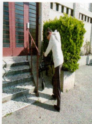
Pente entrée sud 25%